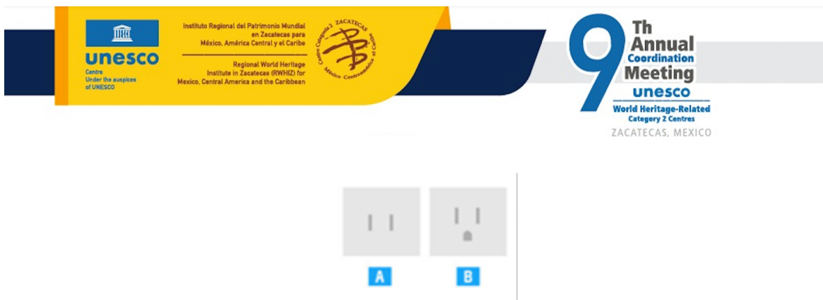
Types of Electrical Outlets in Mexico (Zacatecas)